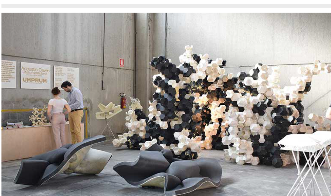
An installation at Fuorisalone by Lambrate Design District

Find additional information on www.Svie.it